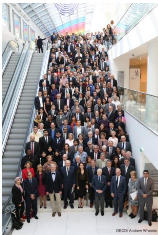
Attendants at the 16th IAOS Conference, jointly organised with OECD

Photos taken during the event can be found in: https://www.flickr.com/photos/159606912@N07/albums