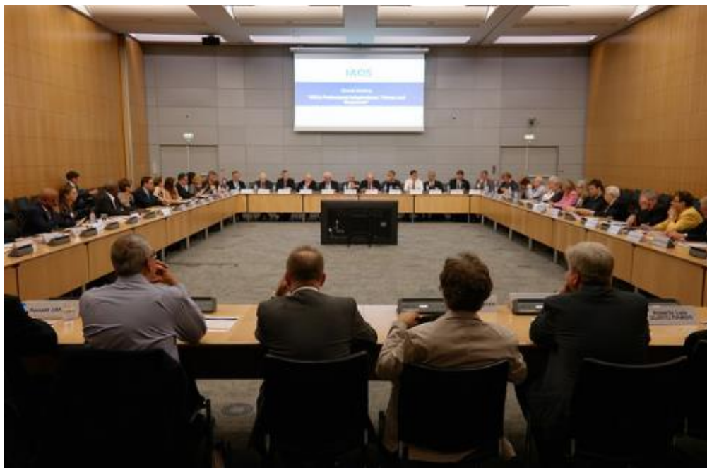
IAOS Special Meeting on Professional Independence