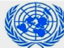
United Nations Statistics Division